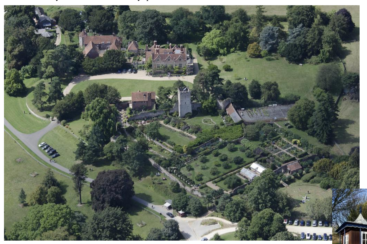
When we reached Grey's Court we immediately spotted the ticket booth.

What we couldn't figure out, though, was how we were meant to get from the kiln and Joyce Grove in Nettlebed to that ticket booth at Grey's Court. Is it meant to be a Tardis?